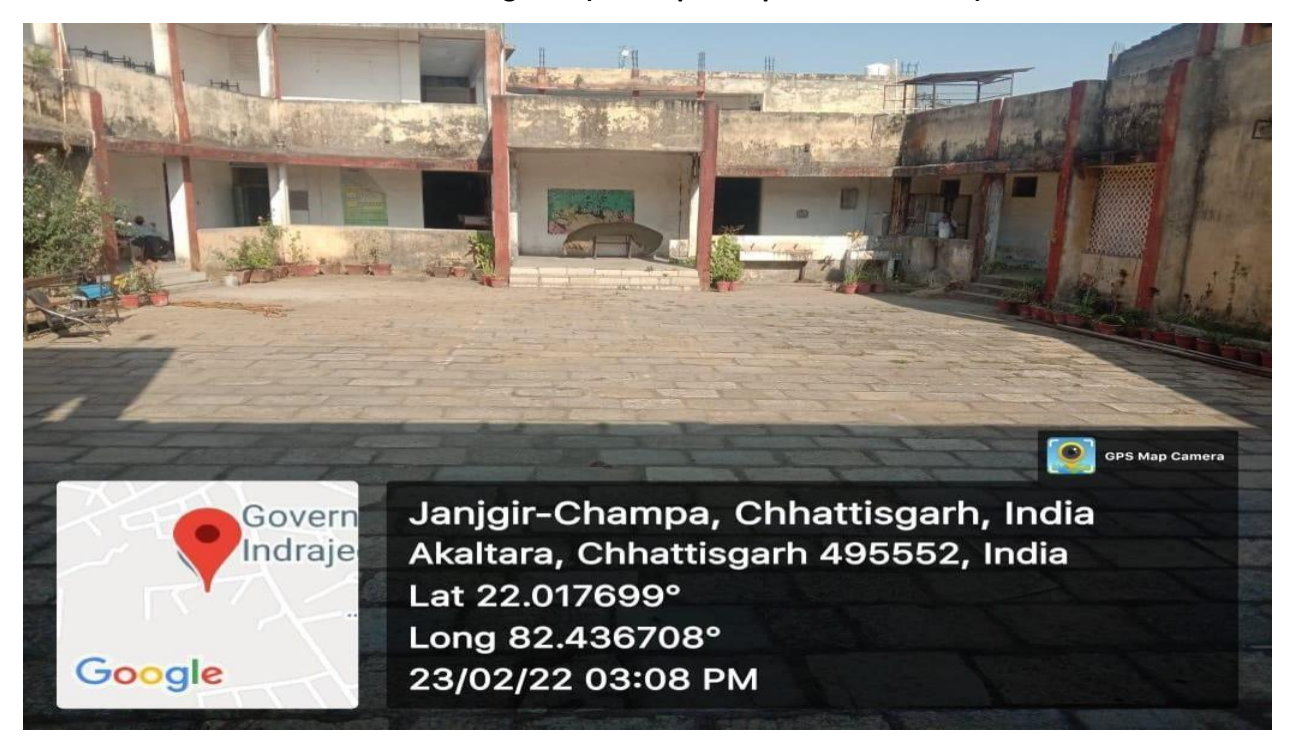
College Lawn for Cultural Activity