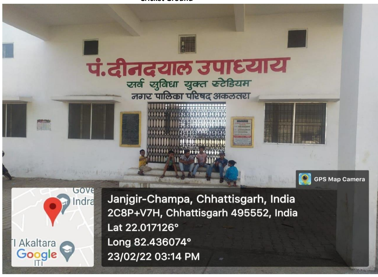
Indoor Outdoor Stadium (Municipal Corporation Akaltara)