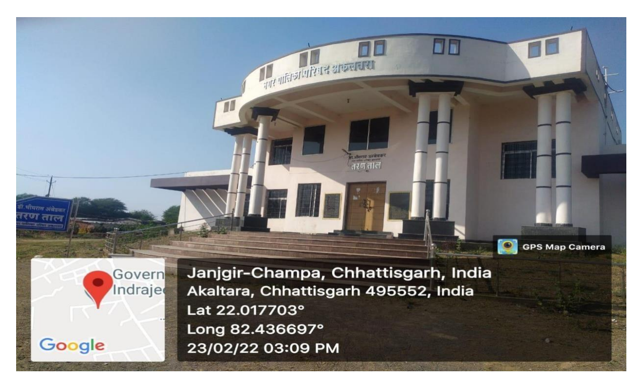
Swimming Pool (Municipal Corporation Akaltara)